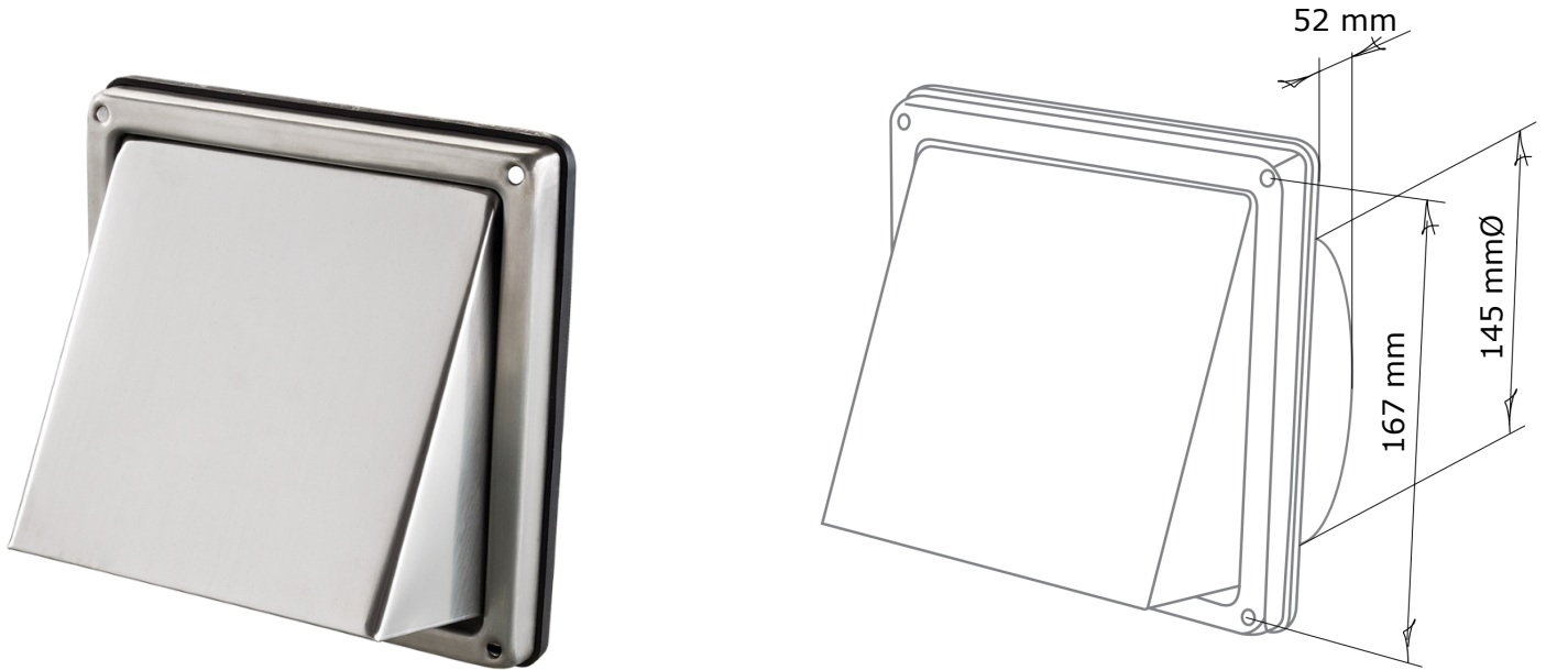
Airflow Performance - 150mm Stainless Steel Cowl with Insect Mesh

Available in multiple sizes and with optional backdraft flap.